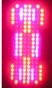
All 136 LEDs